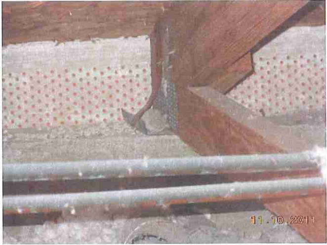
5. Roof Geometry A